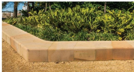
Example of new sawn cut sandstone seating wall