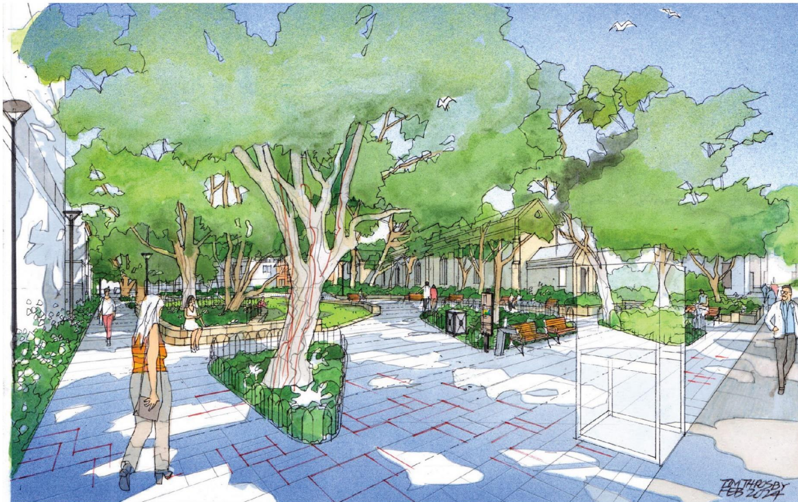
Artist impression of the new Regent Street Reserve looking from Oxford Street

We invite your feedback on the proposed concept design.