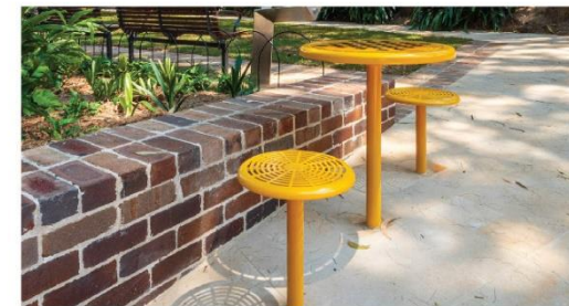
Example of colourful 'cafe style' table and stools