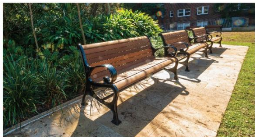
Example of 'traditional style' seating