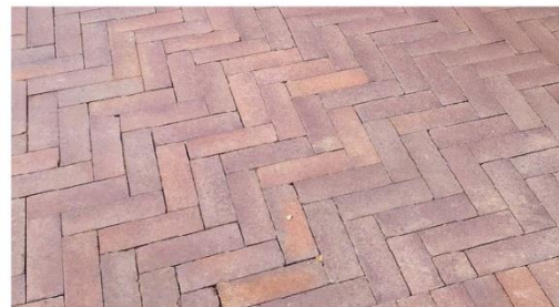
Example of new brick paving